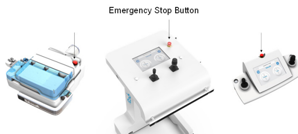
Figure 1: View of the emergency stop areas

CAUTION: When pressing an emergency stop button, conversion to manual technique is required to complete the intervention.